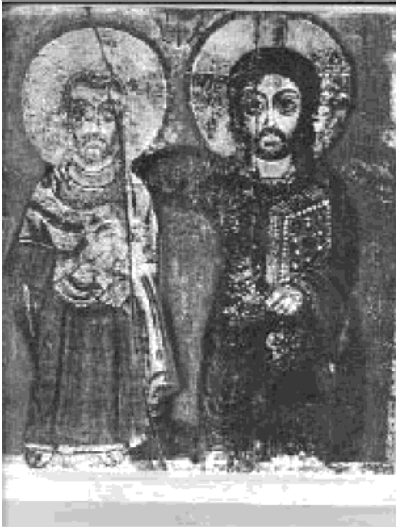
The arm of the Lord on the shoulder of St. Mina in friendship. 6 th century, The Louvre, France

In the realm of Coptic ecclesiastical architecture, we can assume that the genesis of the basilical style in the Christian world may be